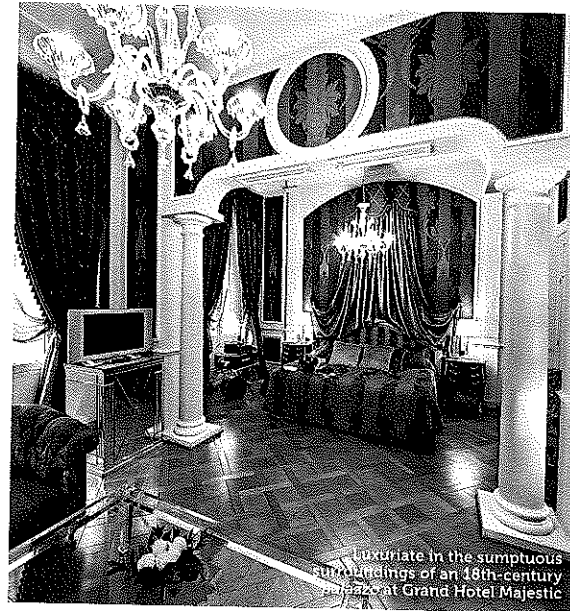
Luxuriate in the sumptuous surroundings of an 18th-century palazzo at Grand Hotel Majestic

TIP The San Luca Express is a new tourist train that takes you on a tour of the city and out to the Basilica of